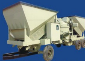
Mobile Concrete Batching Plant