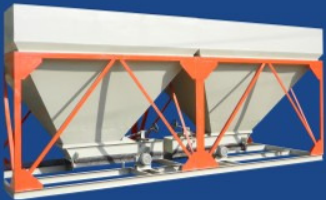
Two Bin Feeder