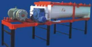
Wet Mix Plant