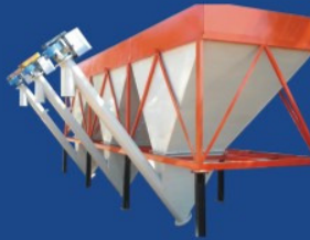
Material Batching System